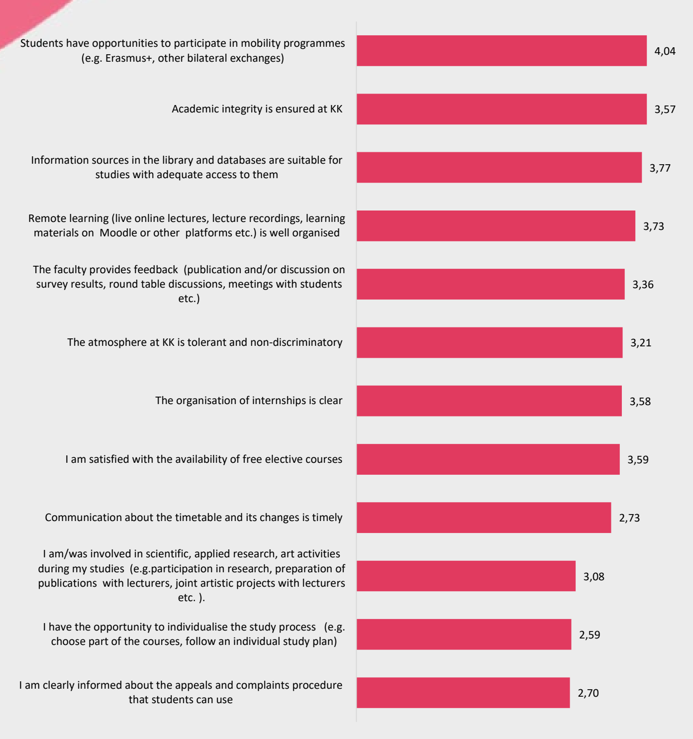
Figure 2. Respondents' evaluation of the organisation of their studies (averages)

Note: The average of the Likert scale is provided. The higher the average, the more respondents agree with the statement