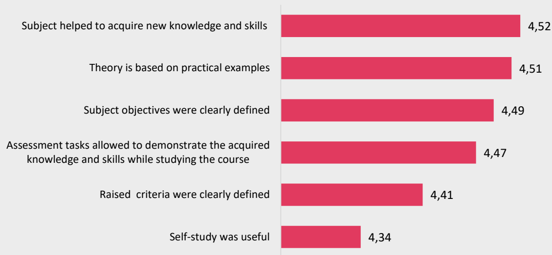
Figure 1. Evaluation of the content quality of the course units taught in the Dental Technology study programme according to the criteria (averages).

RESULTS: 53 questionnaires were received in the Study Management System. Summarizing the obtained results, it can be said that the quality of the content of Dental Technology study programme subjects is rated very high (averages are more than 4 points out of 5). Most respondents agree with statements that the subject helped to acquire new knowledge and skills (4,52) and that theory is based on practical examples (4,51). The least respondents agree with the statement that self-study was useful (4,34) (see Figure 1).