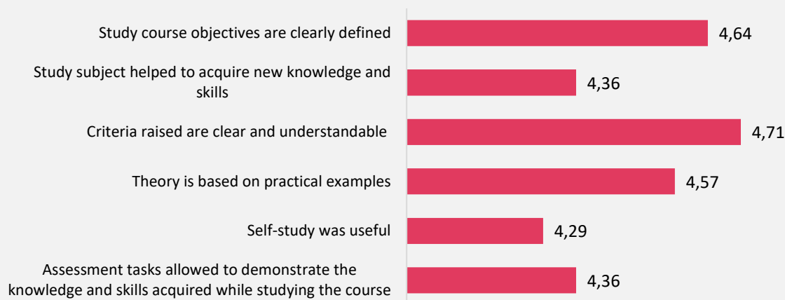
Figure 1. Assessment of the content quality of the subjects of the Pharmacy techniques study programme according to criteria (averages).

Note: The average of the Likert scale is provided. The higher the average, the more respondents agree with the statement